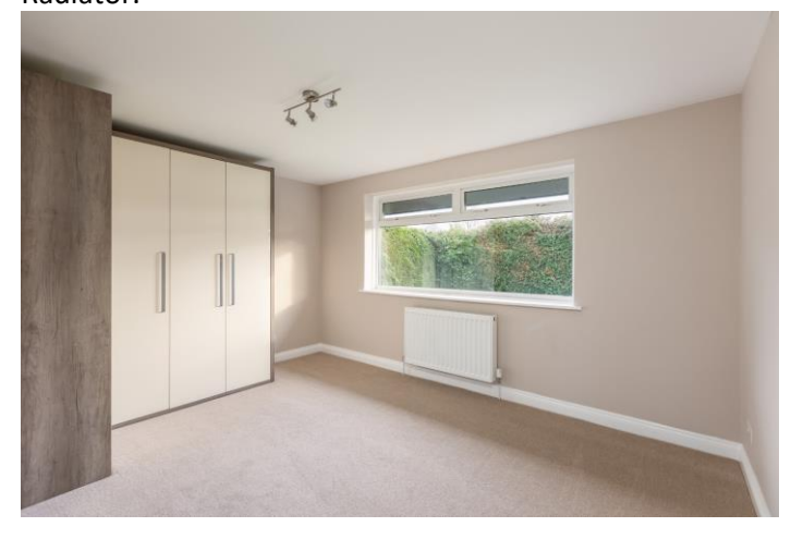
BEDROOM TWO 3.20 m(10'6") x 3.10 m(10'2") Casement window to the side. Television point. Radiator.

French windows opening out onto the decking. Casement window to the rear. Wardrobes with glass fronts. Coving. Radiator.